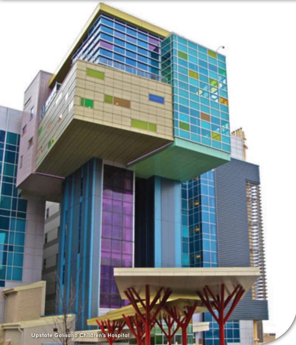
Upstate Golisano Children's Hospital

A cornerstone of VisionCNY is the goal, targets, strategies, and project recommendations which have been developed for each policy area addressed in the plan.