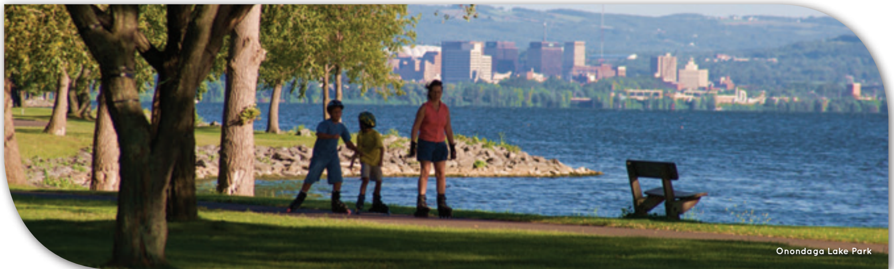
Onondaga Lake Park

Goal: Adapt successfully to a changing climate and improve the resilience of the region's communities, infrastructure and natural systems.