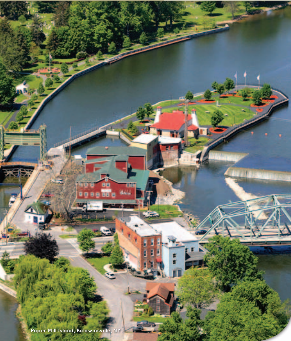
Paper Mill Island, Baldwinsville, NY

Community representatives organized the plan around several major public policy issues including energy, infrastructure, land use, environment, economic development, materials management, and climate adaptation.