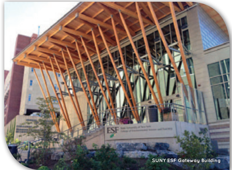
SUNY ESF Gateway Building

In keeping with its mission as a public planning and development agency serving the counties of Cayuga, Cortland, Madison, Onondaga, and Oswego, the Central New York Regional Planning and Development Board looks forward to working with community representatives from across the region to provide leadership and serve as a steward responsible for helping to ensure the successful implementation of the plan while measuring the region's success in achieving a sustainable future.