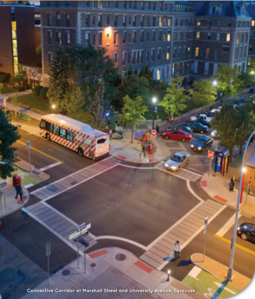
Connective Corridor at Marshall Street and University Avenue, Syracuse

VisionCNY is a comprehensive plan that has been carefully calibrated to meet the needs of communities across the five-county region. The document represents a short-term, action-oriented guide and a long-term strategy that can be used to help ensure that the region can meet the needs of future generations.